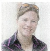
The Gay & Lesbian Wedding Expert

Gay & lesbian wedding planning tips, trends & news Read the latest!